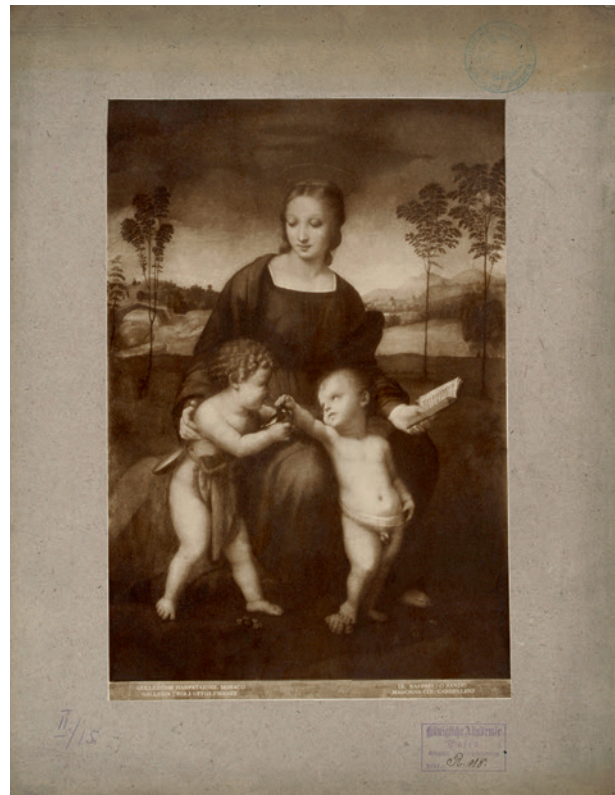
Fig. 1. Reproduction of the Madonna painting by Rafael Santi, atelier Franz Hanfstaengl, stamp: Königliche Akademie, Posen; Institute of Art History Photo Archive at Adam Mickiewicz University in Poznań

The period of the Royal Academy in the collections of the photo archive documents mainly the collection of repro-