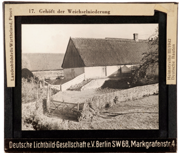
Fig. 6. Photography of village buildings on the Vistula, Landesbildstelle Wartheland in Posen; Institute of Art History Photo Archive at Adam Mickiewicz University in Poznań

The Institute of Art History at the Reich University was tasked with research on, inter alia , German art (this term encompassed the territories annexed to the Reich,