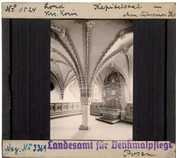
Fig. 5. Photography of interiors of the monastery in Łąd, Landesamt für Denkmalpflege in Posen; Institute of Art History Photo Archive at Adam Mickiewicz University in Poznań

supplemented the collection of photographs of German Baroque architecture 26 .