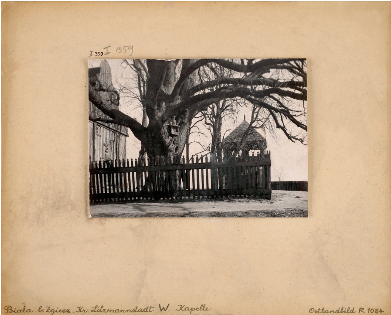
Fig. 7. Photograph of Chapel in Biała, photo print glued on cardboard