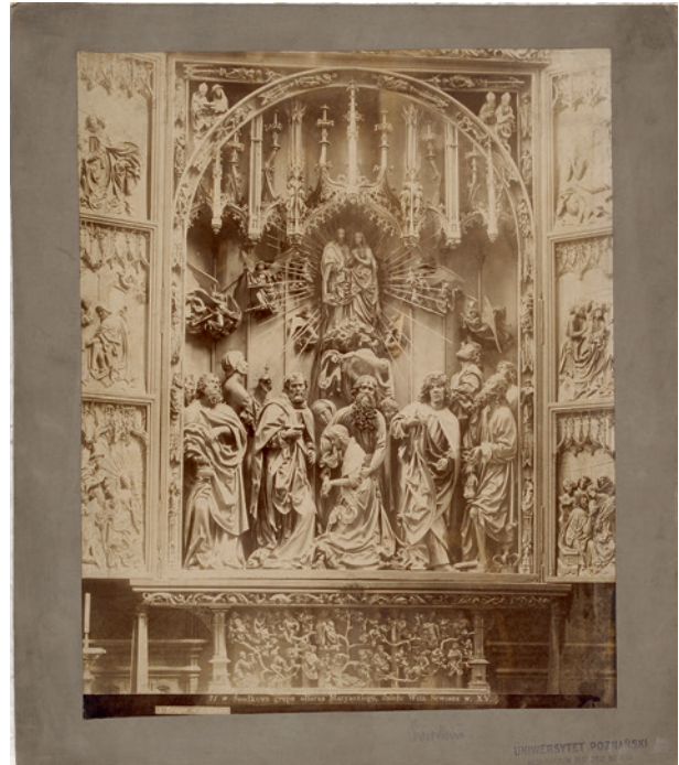
Fig. 3. Photography of Veit Stoss's altar in St. Mary Church in Cracow, stamp: Uniwersytet Poznański / Seminarjum Historii Sztuki

After Germany's attack on Poland in 1939, Poznań became the capital of the Wartheland, annexed directly to the Reich. Since the autumn of 1939, the Germans began to organise the Reich University, including the Institute of