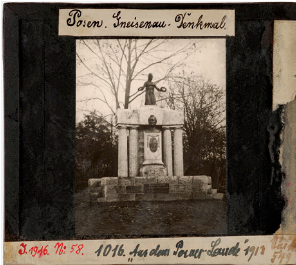
Fig. 2. Diapositive with a reproduction of newspaper illustrations – monument of general August Neidhardt von Gneisenau in Poznań, Newspaper Aus dem Posener Lande 1913